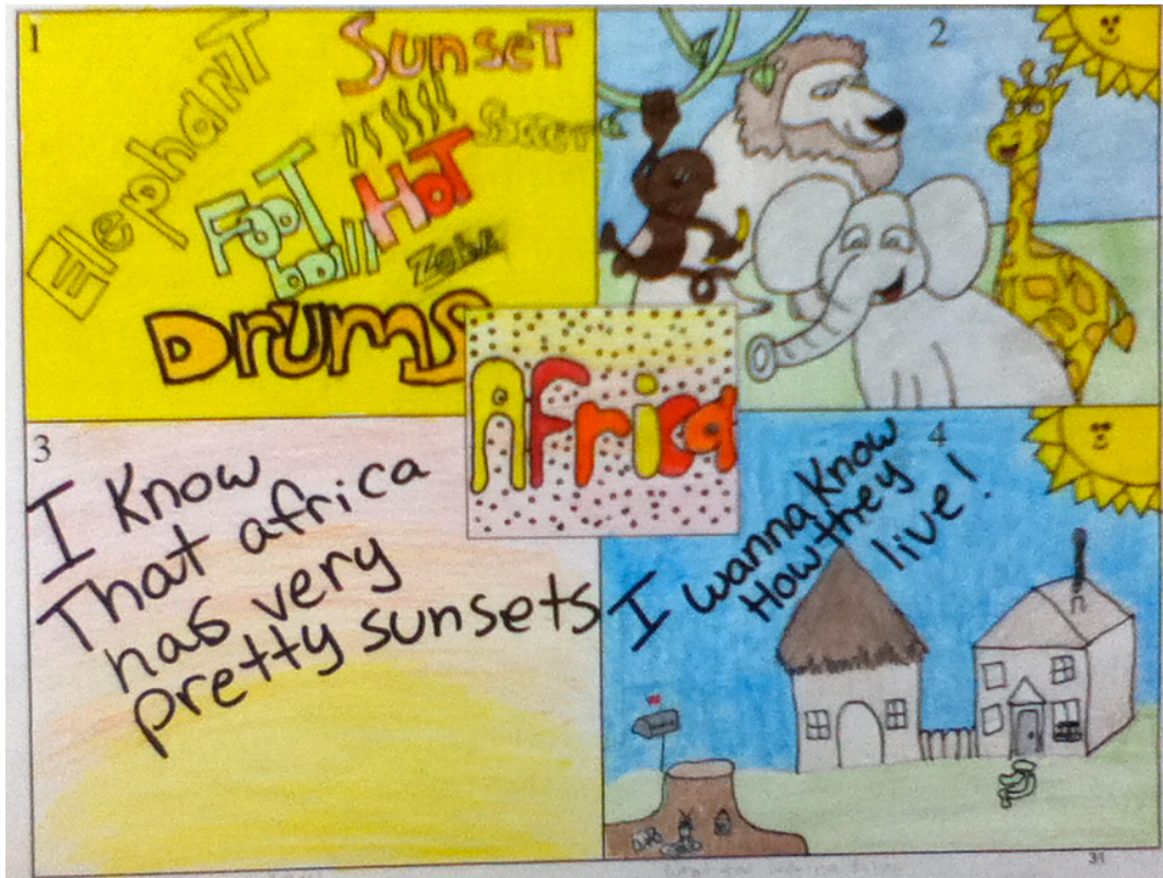
Frayer Model example of pre-assessment.