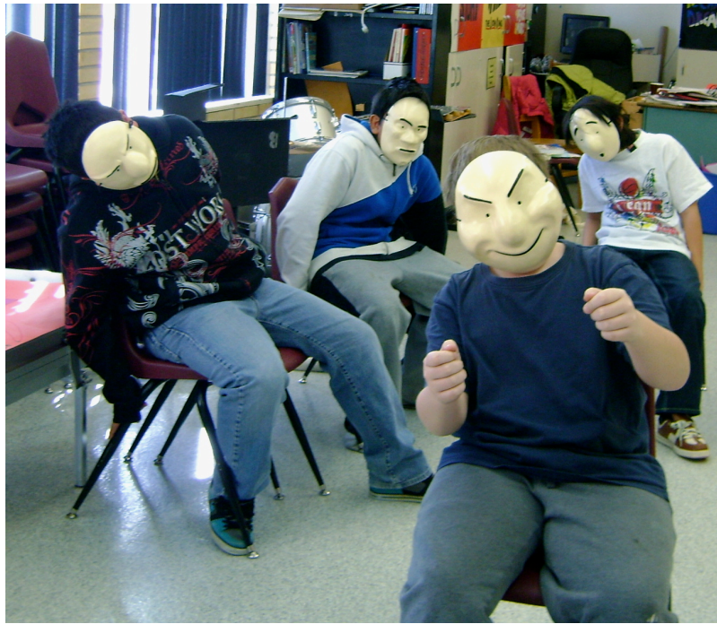
The Bad Bus Driver: clear roles for each character as shown through body language and appropriate to the mask.