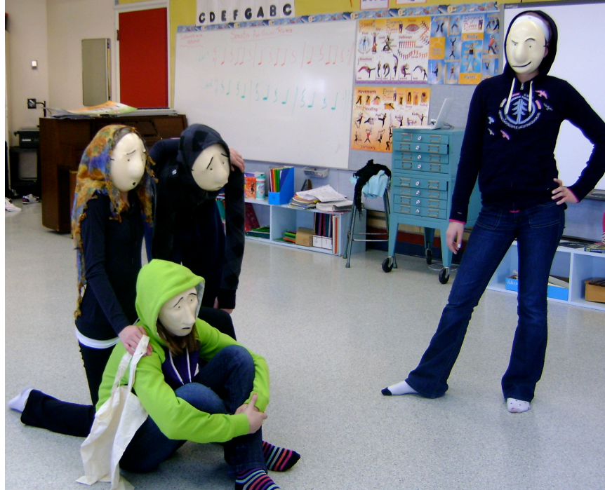
Busted!: Power and status are evident in this tableau.